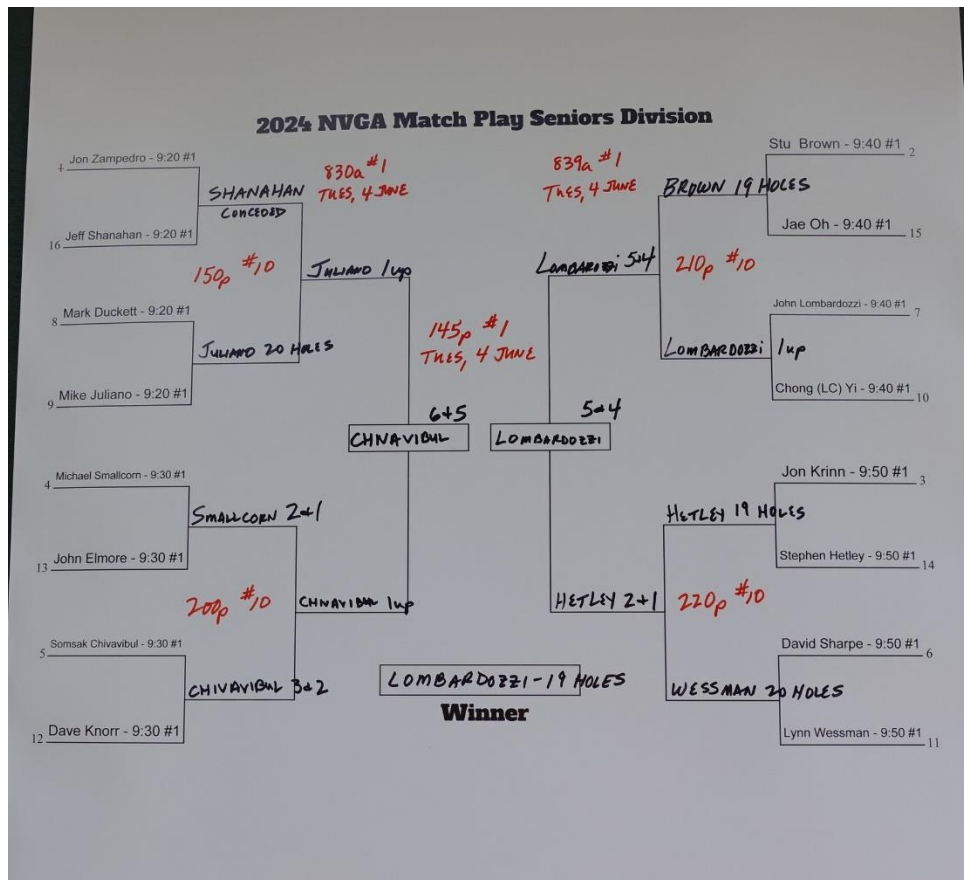
Senior Division Scoreboard